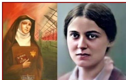
Saint Edith Stein, 1891-1942 Teresa Benedicta of the Cross